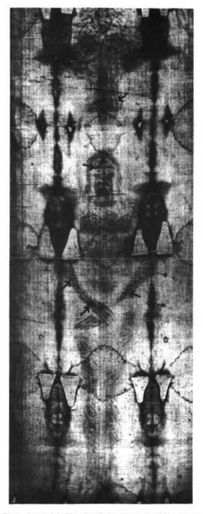
Fig. 1. Image of the Shroud of Turin with the alleged blood areas indicated.

Interestingly, the Spanish linen fibrils showed a clear spectrum in the visible with a peak at 550 nm and shapes indicative of the spectrum of reduced hemoglobin,<sup>6</sup> thus explaining their more garnet appearance from the browner Shroud fibrils. Thermodynamically the latter fibrils would be expected to show the spectrum of a fully oxidized denatured met-hemoglobin, i.e., a so-called perturbed acid met-hemoglobin.<sup>7</sup> Although the spectra of the Shroud fibrils are, in fact, indicative of such a spectrum, the high degree of scattering from these solid samples makes the visible band shape features less distinct and does produce peak shifts from the solution spectra (see Fig. 2 for a typical spectrum of one of the Shroud-stained fibrils). Therefore, this identification is much less positive than desired.